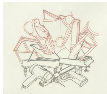
Study for Modern Music

Black and red tape on polyester drafting film